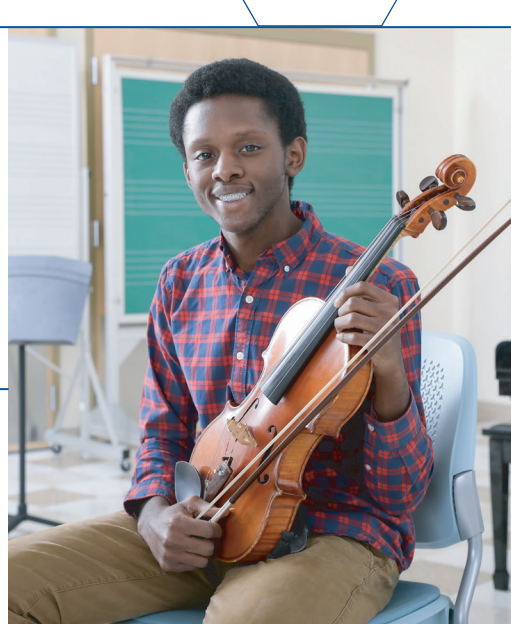
Thank you for believing in our students!

Please contact the Foundation at (518) 381-1322 for more information.